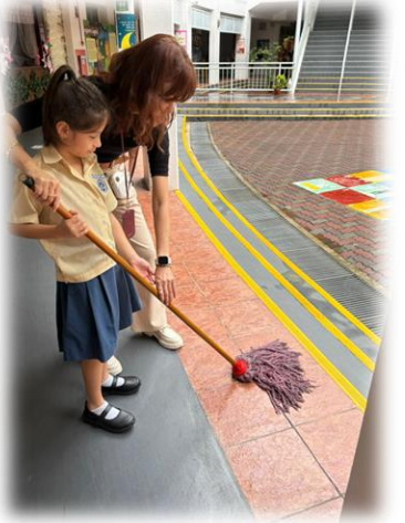
Every White Sandian, A Success Story