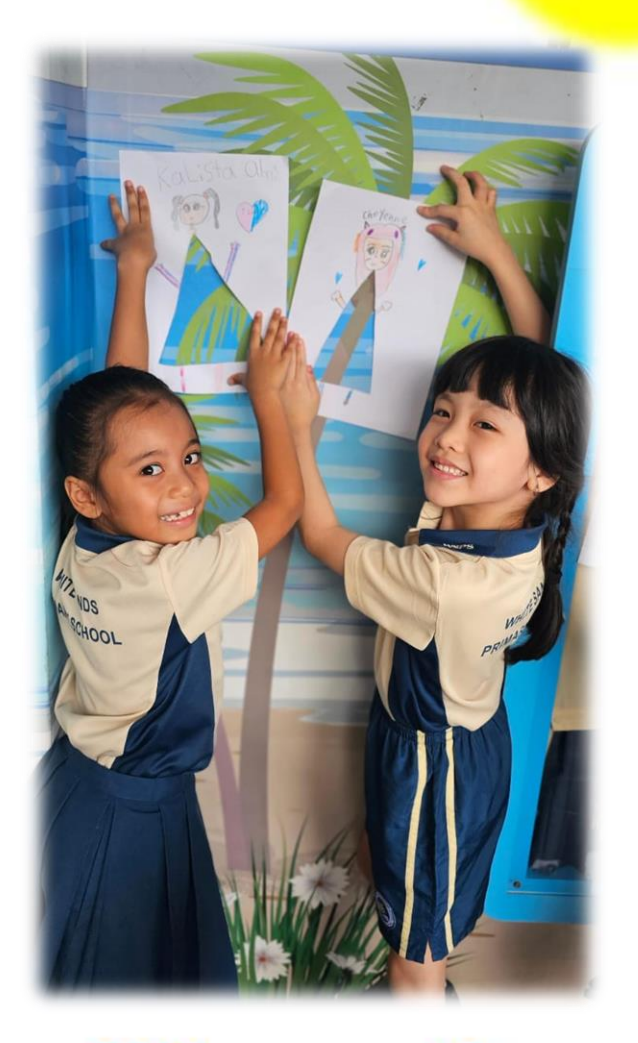
Every White Sandian, A Success Story